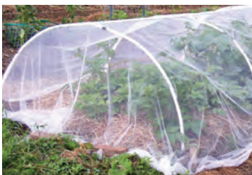
Row covers keep snails out.