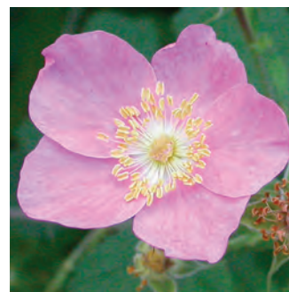
Rose varieties with fewer petals, like the native Rosa californica , grow better in cool summer areas.