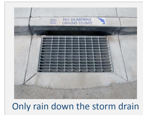
Only rain down the storm drain